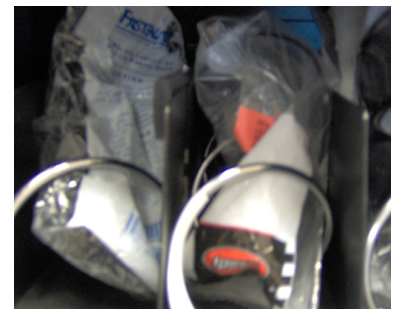
safety glasses from multiple vendors dispensed from a 10 count single helix