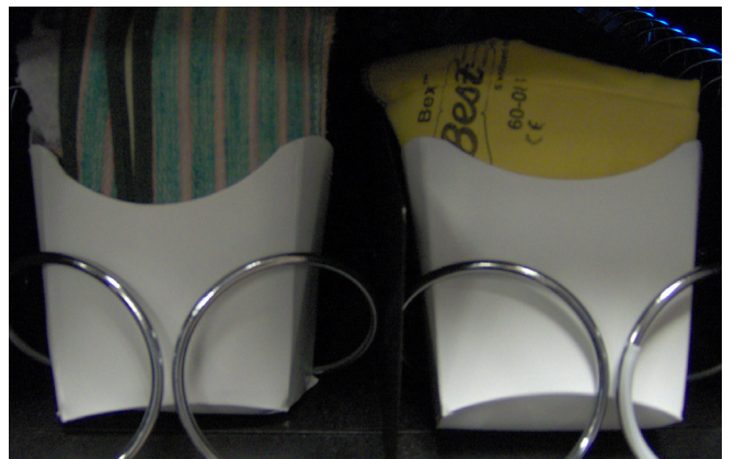
leather welding gloves and kevlar gloves stored and dispensed in french fry containers to ensure proper vending