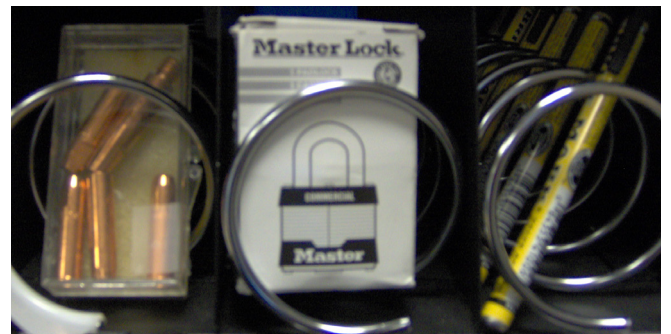
welding tips, locks and brite mark pens dispensed from multiple helix sizes